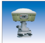
A3 Static Receiver