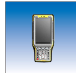
F59 GNSS Handhelder