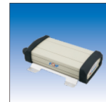
A100 Reference Receiver